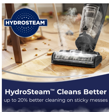
HydroSteam™ Cleans Better up to 20% better cleaning on sticky messes