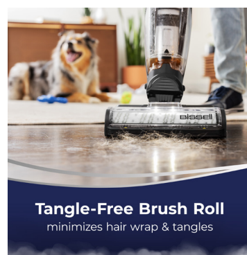
Tangle-Free Brush Roll minimizes hair wrap & tangles