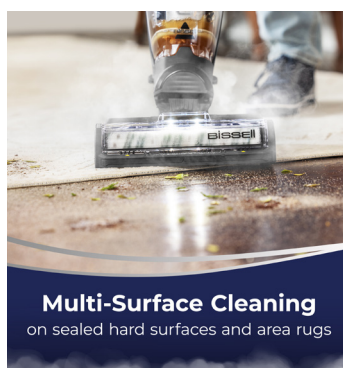
Multi-Surface Cleaning on sealed hard surfaces and area rugs